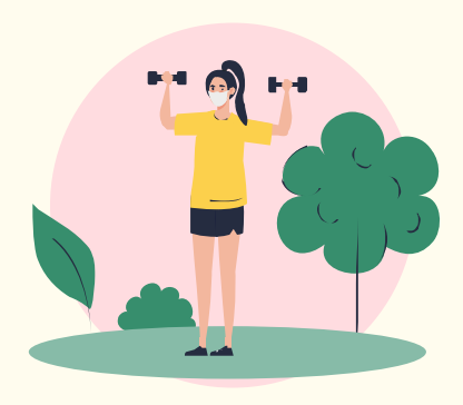
Tell a friend.

Develop SMART goals: Specific Measureable Acheivable Realistic Timed